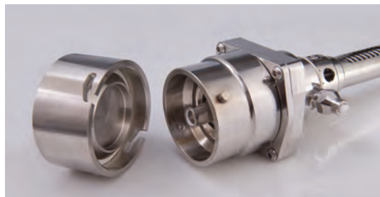
ProPurge Valves with CIP Caps