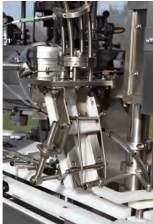
End Feeder Assembly