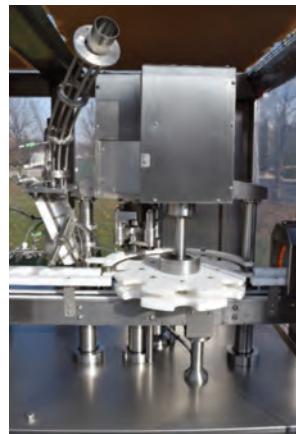
Single Head Seamer