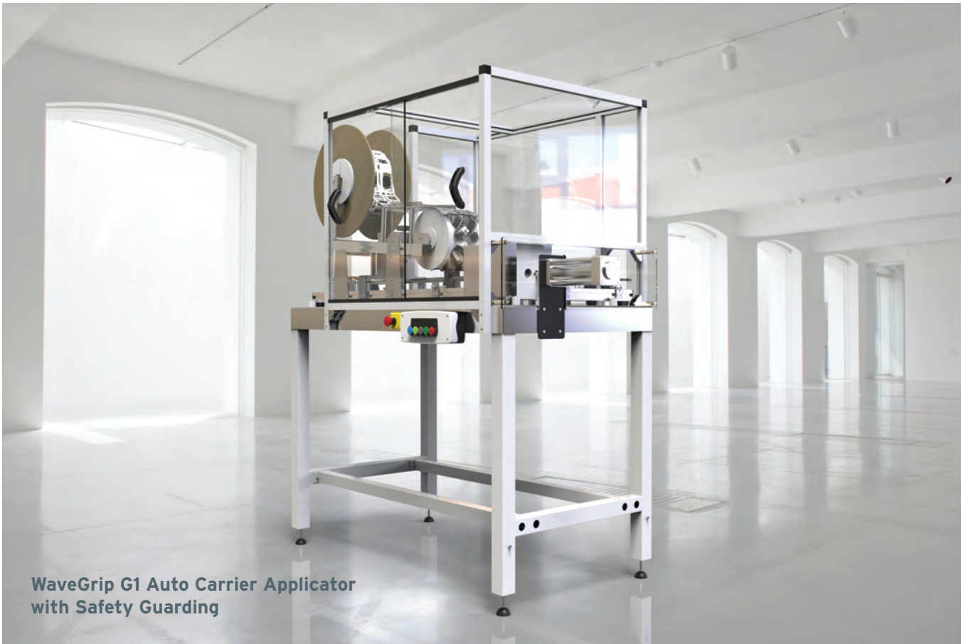
WaveGrip G1 Auto Carrier Applicator with Safety Guarding