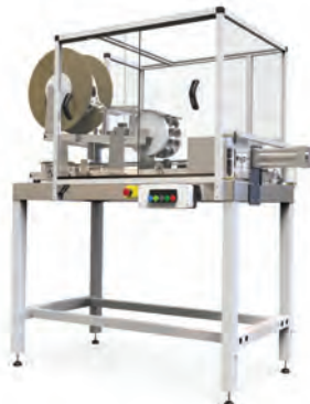
G1 Auto Applicator 100 CPM