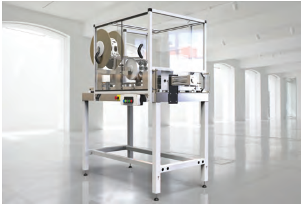
WaveGrip G1 Auto Applicator