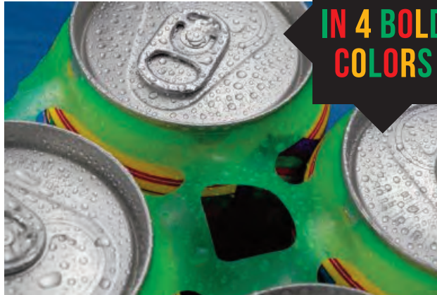
Safe and secure 6-pack carrier

WaveGrip is an innovative new solution to your can collation needs which is easily applied to the rim of your cans to turn them into safe and secure multi-packs.