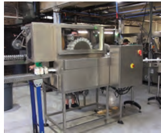
G2 Applicator 100-500 CPM