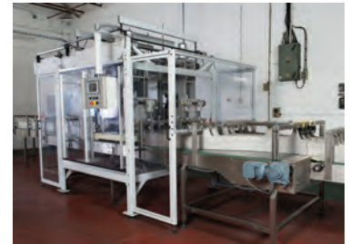
G3 Applicator Up to 2,000 CPM